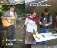
Emmett from LAPEL